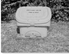
Stow Road Opposite the School Field