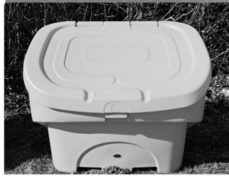
Saxilby Road Next to the bus shelter