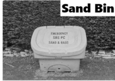
The Close Opposite the Village Hall