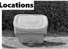
Capps Island, Stow Road