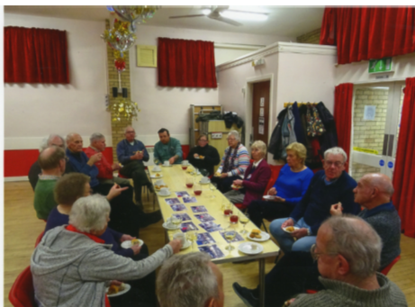
The Bowls Club Christmas Party